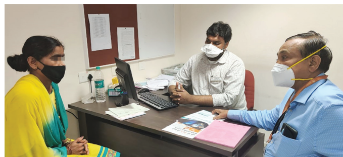
Fig. 1.1: The patient is being briefed about her illness, why and what type of surgery will be done, possible alternatives for surgery and complications related to surgery